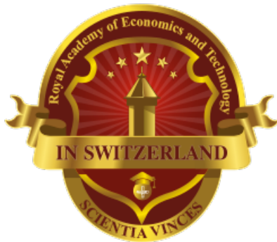
Royal Academy of economics & technology OUS Switzerland