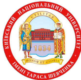
Taras Shevchenko National University KNU Ukraine

OUS Switzerland, Public Relations Office, Freilagerstrasse 39, CH-8047 Zurich, Switzerland