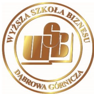
University of Dąbrowa Górnicza WSB Poland