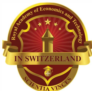
OUS Royal Academy of Economics and Technology in Switzerland