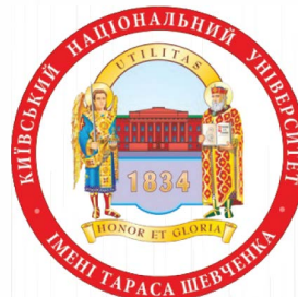
TARAS SHEVCHENKO NATIONAL UNIVERSITY UKRAINE